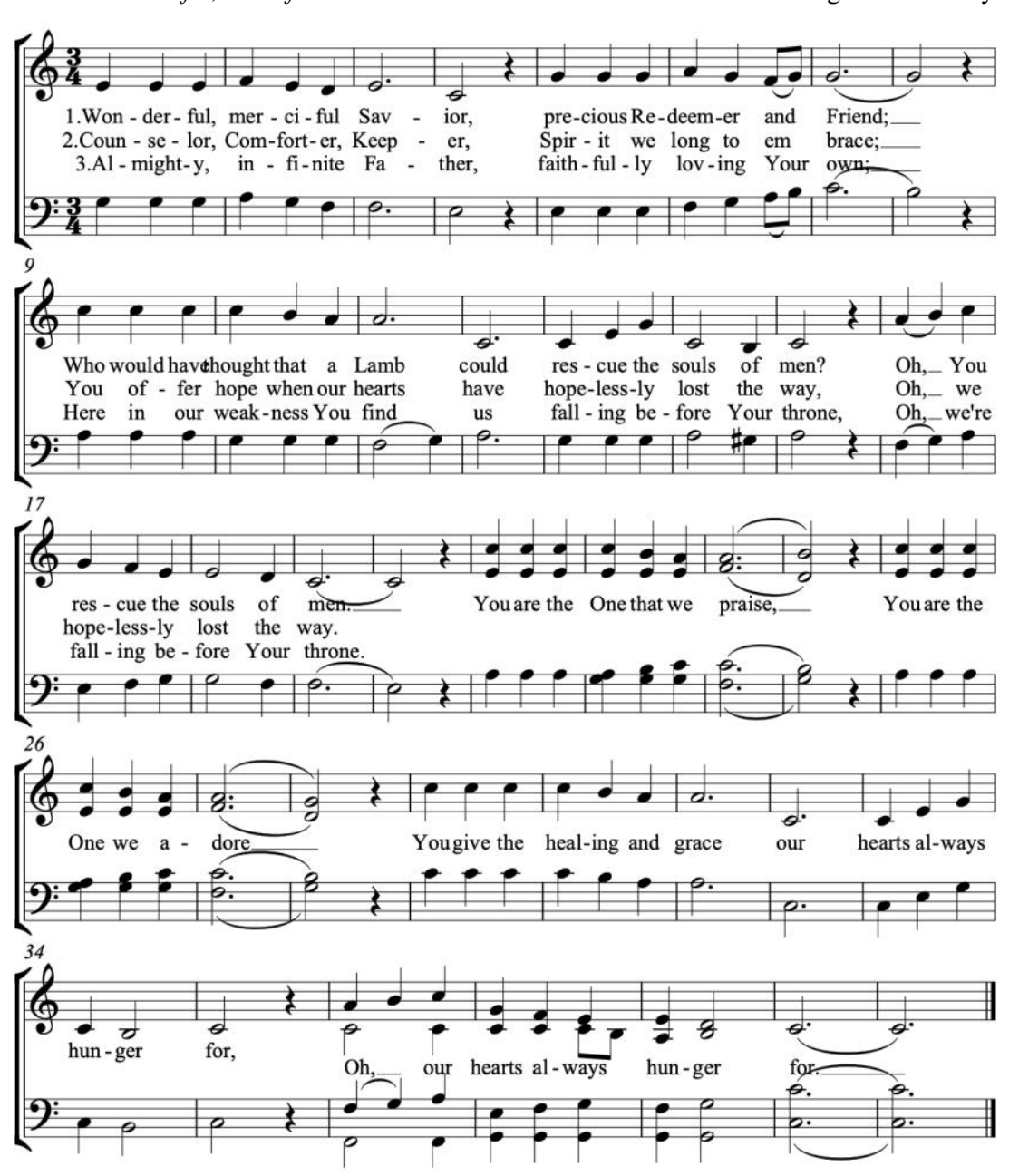
Copyright © 1989 Dayspring Music, LLC Word Music, LLC CCLI 294262