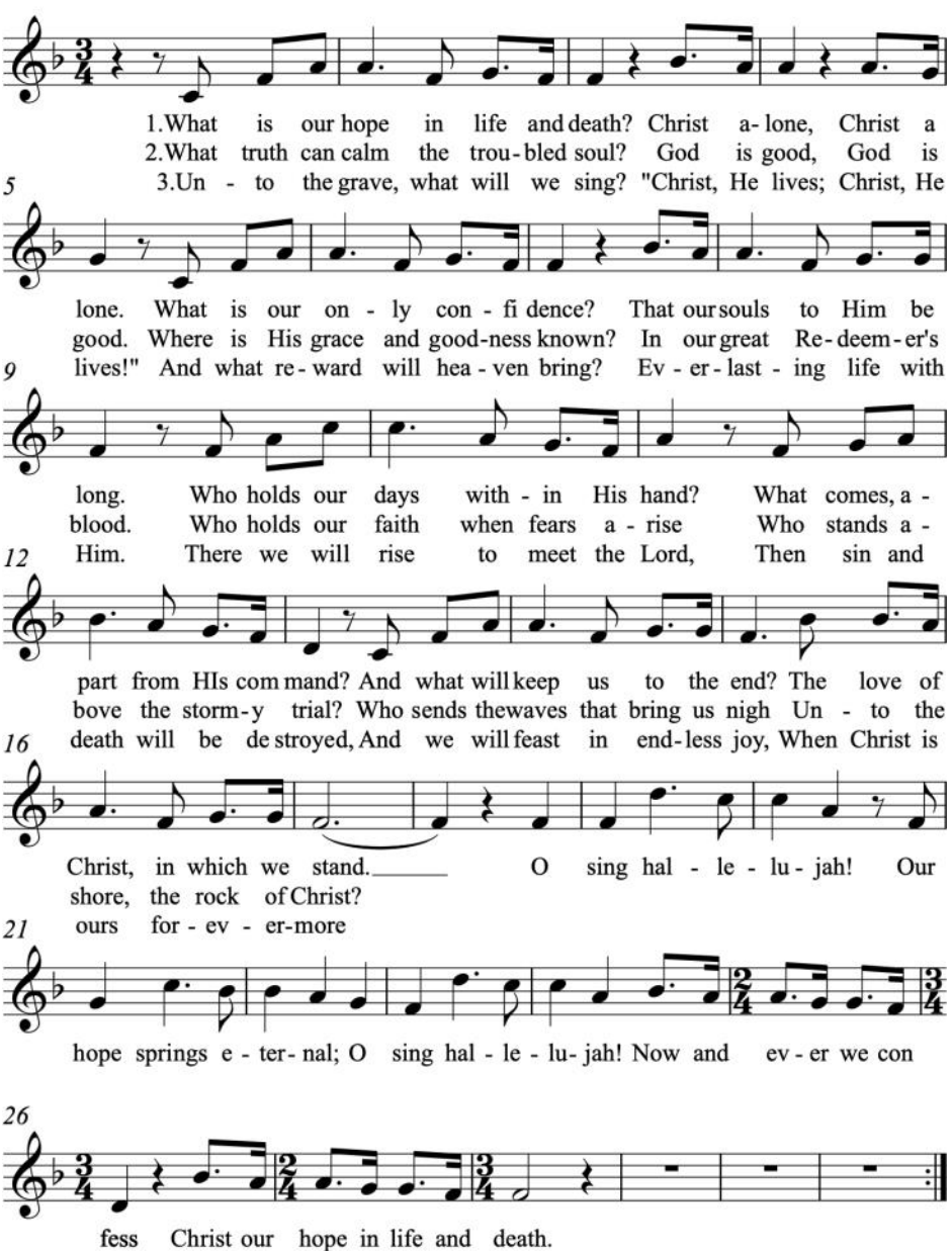
fess Christ our hope in life and death. Copyright © Getty Music