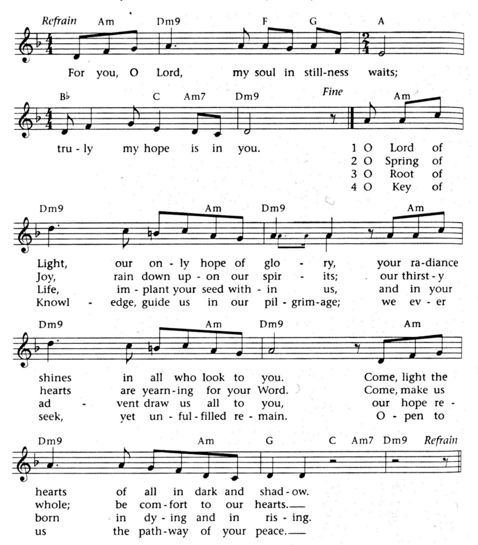
SONG OF CONFESSION: My Soul in Stillness Waits (Verse 1)