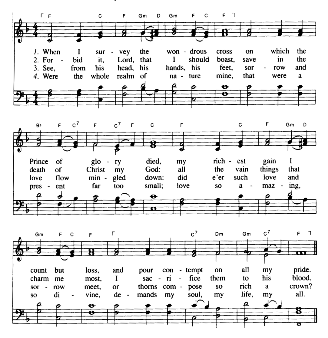
* CLOSING HYMN: When I Survey the Wondrous Cross