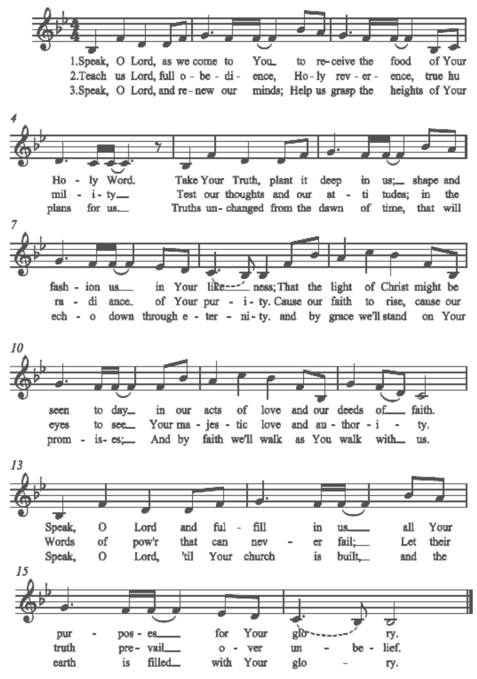
Copyright © Thankyou Music Used by permission, CCLI