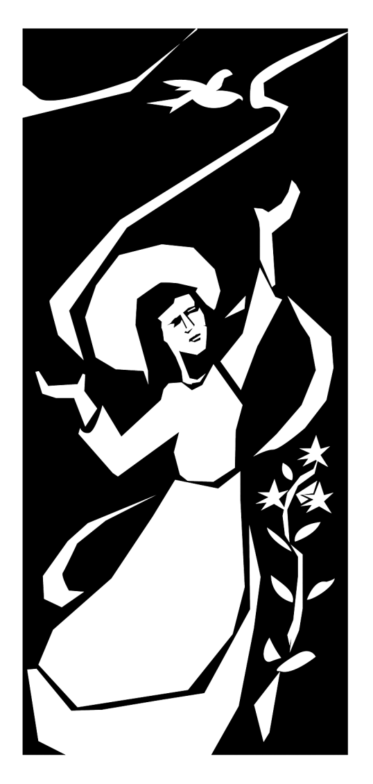
SECOND SUNDAY IN ADVENT