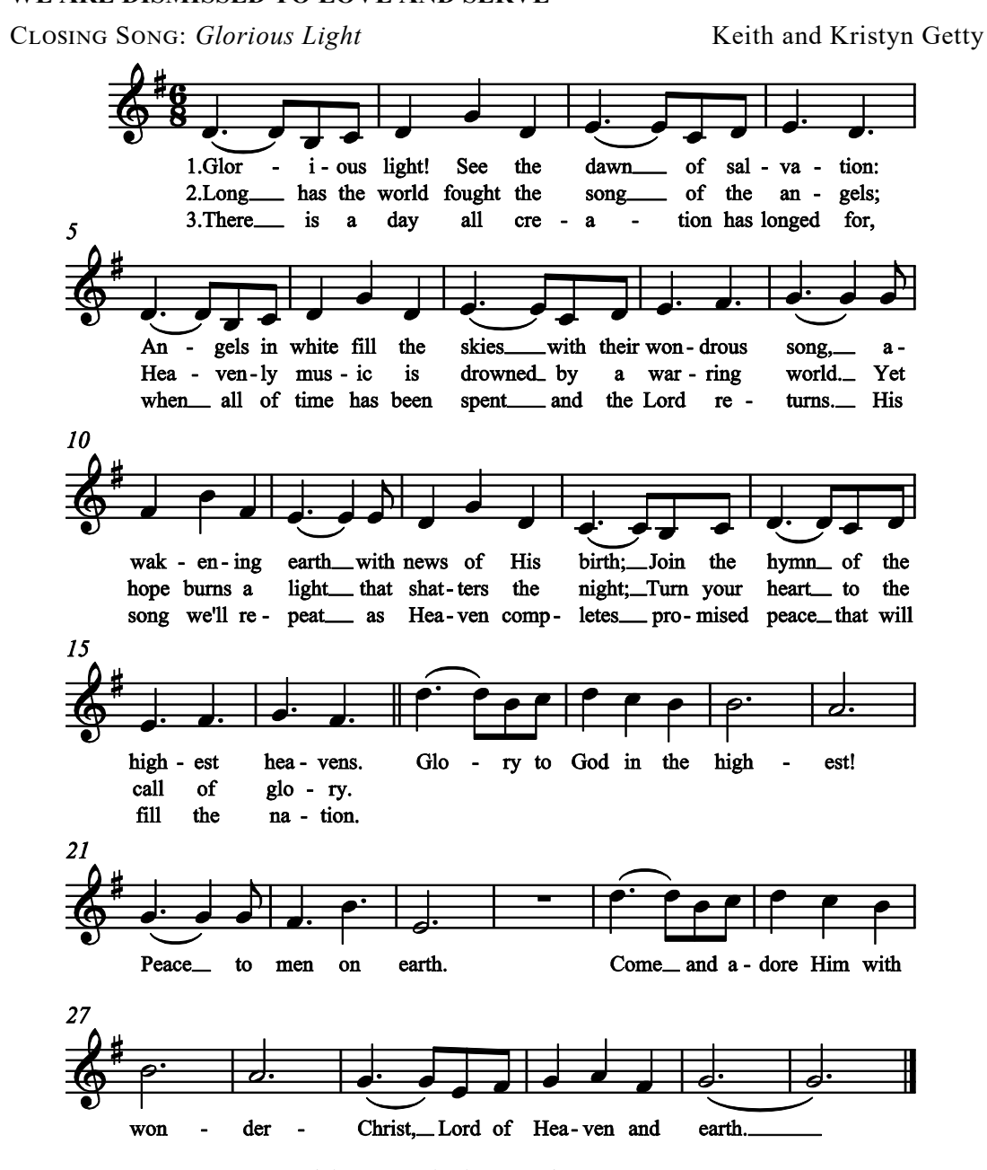
Copyright © 2004Thankyou Music CCLI 294262